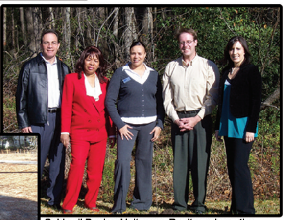
Coldwell Banker Holtzman, Realtors chose the perfect location at their General Stewart office to watch their oak tree grow into the future.