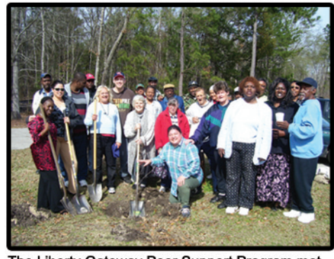
The Liberty Gateway Peer Support Program met Friday morning to plant a dogwood.