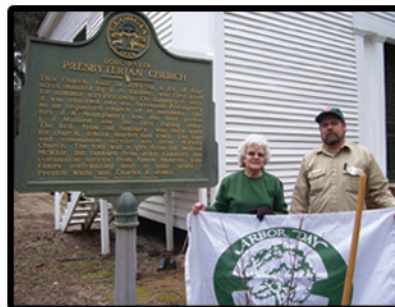
The historic Dorchester Presbyterian Church planted 13 dogwood trees.