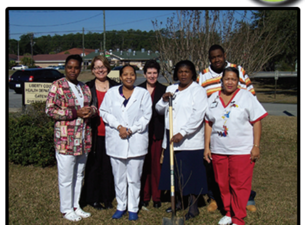
Nurses and staff from the Liberty County Health Dept. and Diversity Health Center had a ball finding a good spot for their dogwood tree Thursday.