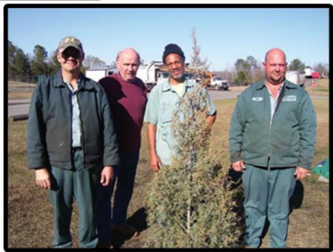
Liberty County Solid Waste staff planted several trees this week in honor of Arbor Day.