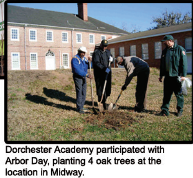
Dorchester Academy participated with Arbor Day, planting 4 oak trees at the location in Midway.