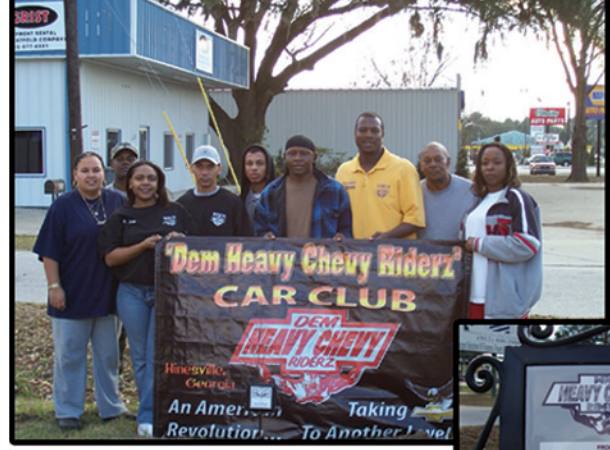
Dem Heavy Chevy Riderz dedicated their dogwood to their members who serve in the military and are currently deployed.