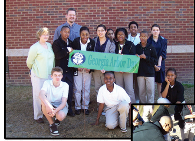
Members of the Midway Middle School Builders Club plant a dogwood tree to fulfill their mission to beautify their school.

Liberty County businesses, churches, civic clubs, schools and others met the challenge this Arbor Day planting more than 120 trees community-wide.