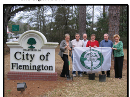
The Flemington City Council planted two LeCounte Pear trees on their grounds Thursday.