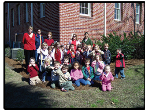
First United Methodist PreK plan to use their tree as a learning tool for students and faculty.