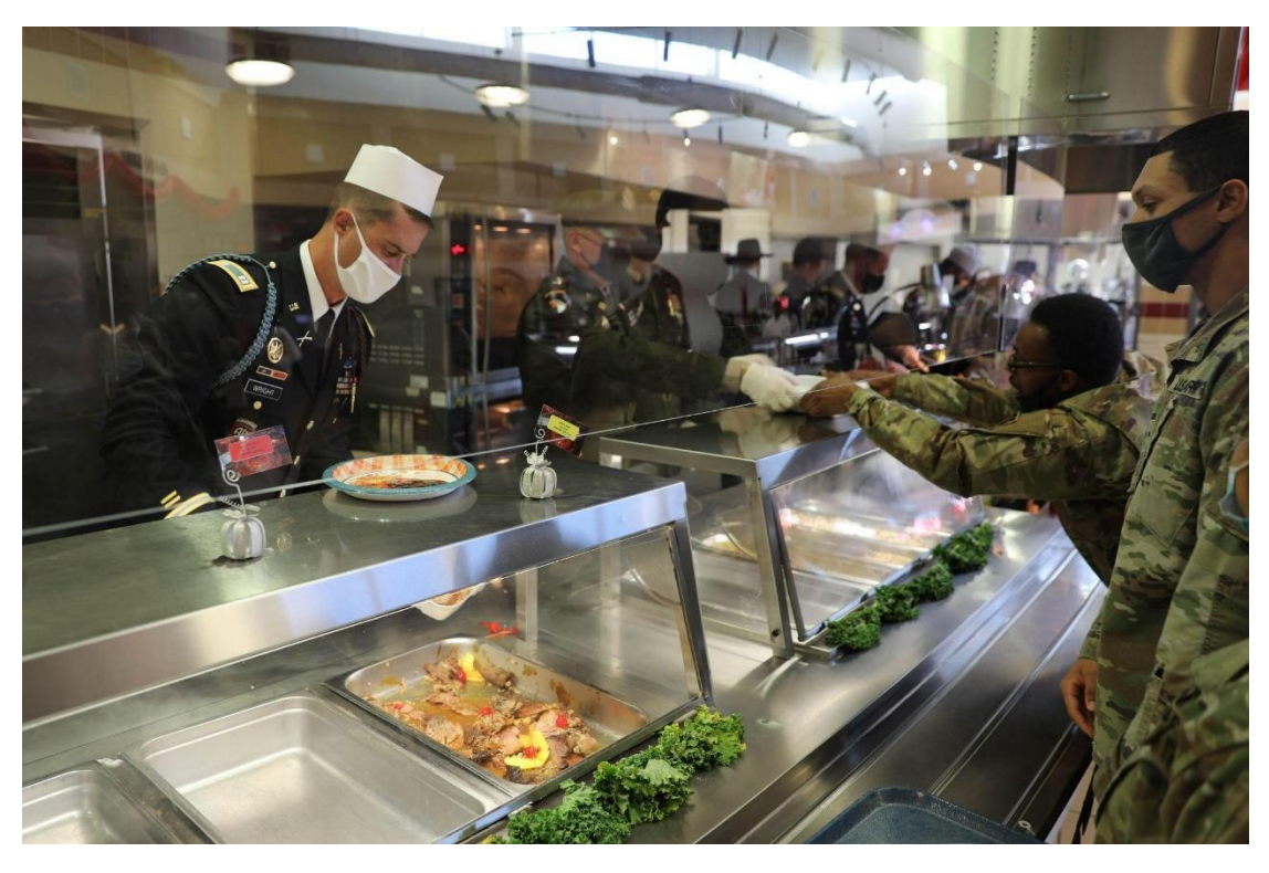
U.S Army Soldiers assigned to 3rd Infantry Division serve Soldiers and Family members at a Thanksgiving luncheon at Fort Stewart, Georgia, Nov 24, 2021. Serving the Thanksgiving luncheon is a time-honored tradition for leaders to show appreciation for their Soldiers.