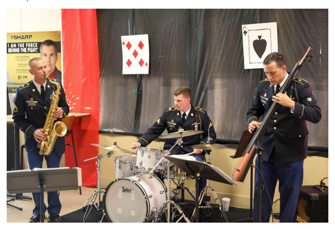
U.S Army Soldiers assigned to the 3rd Infantry Division, play music at the Spartan Dining Facility restaurant at Fort Stewart, Georgia, Nov. 24, 2021. Serving the Thanksgiving luncheon is a time honored tradition for leaders to show appreciation for their Soldiers.

Infantry Division, serves a holiday meal to Soldiers in the Spartan Dining Facility on Fort Stewart, Georgia, Nov. 24, 2021. Serving the Thanksgiving luncheon is a time-honored tradition for leaders to show appreciation for their Soldiers. (U.S. Army photo by Spc. Dre Stout)